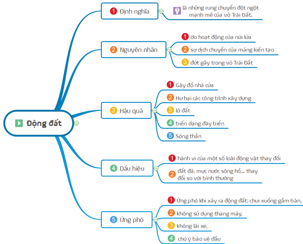
Figure 2. Mind map illustrating the content of “Volcanoes and earthquakes”

We compared the results of the tests and observed the learning attitudes of students in classes that used mind maps with those of students who did not use mind maps in practice. The results show that the quality and attitude of learning of experimental class students is better.