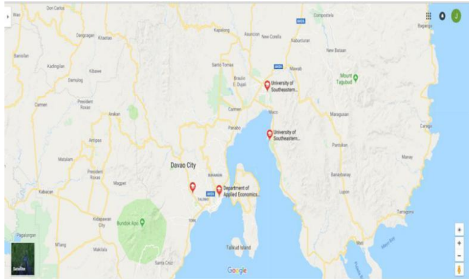
Figure 2. Site Map